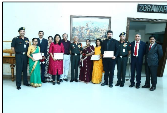
2019-20 : Winners and their Parents With COAS, VCOAS, DGPP and Director CLAWS