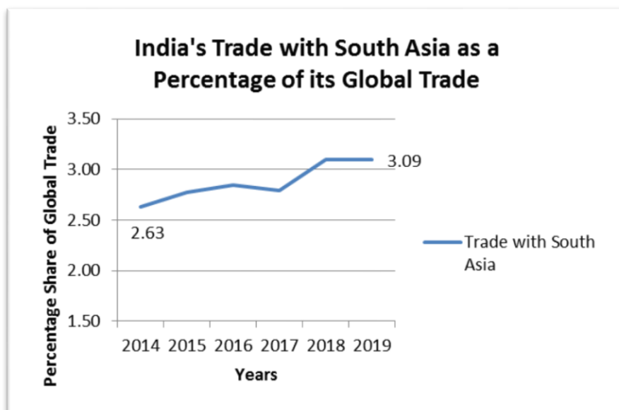
Graph 2: India's Trade with South Asia as a Percentage of its Global Trade (2014-19)